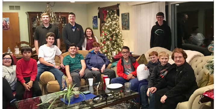
Pictured are Youth Group members who helped with the Christmas decorations at the Rectory.