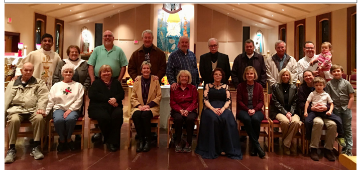
Pictured are parish couples who attended the Marriage Anniversary Celebration that was held here on November 26th.