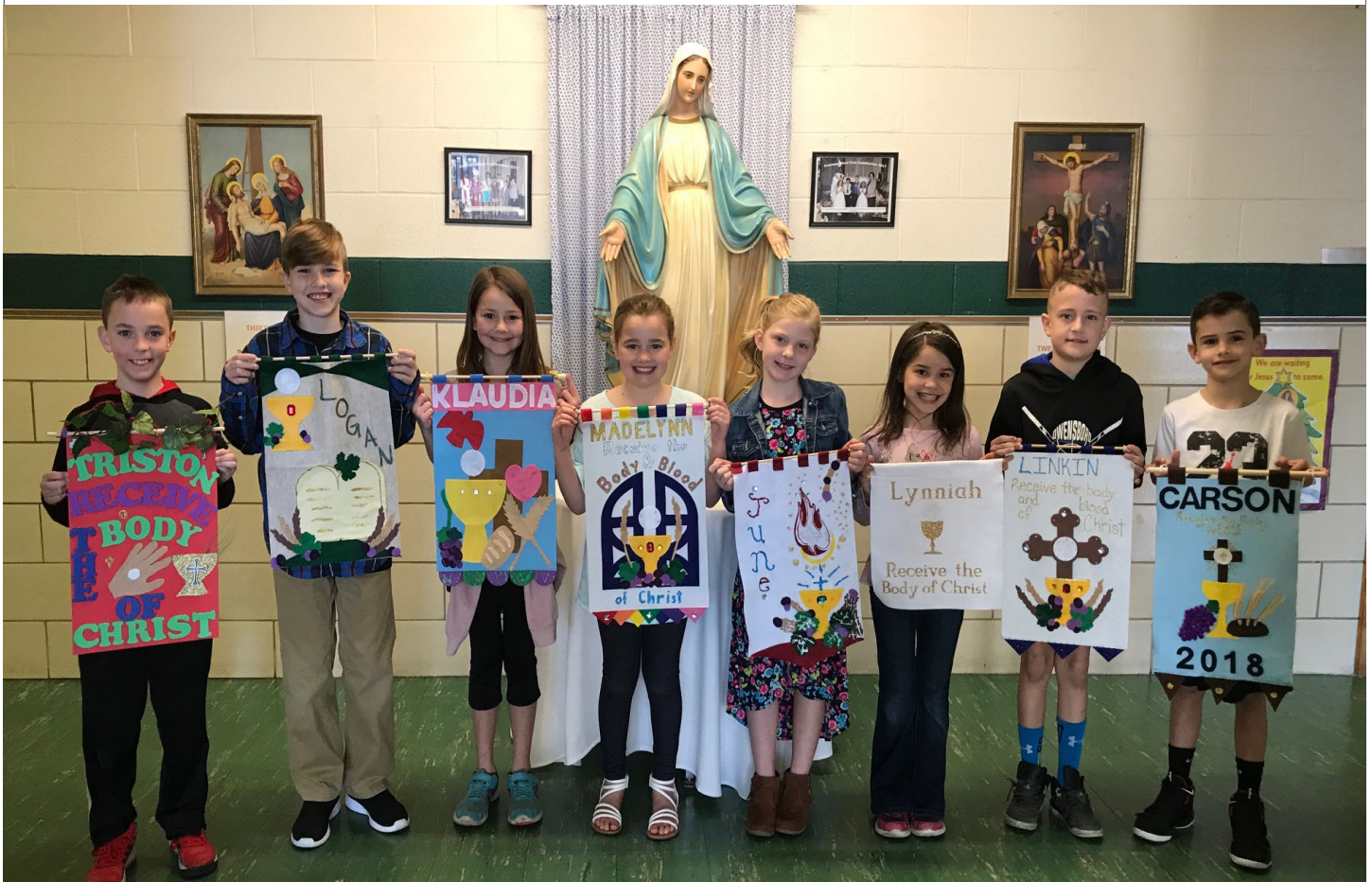
Pictured are First Communion candidates displaying their banners. They participated in a Prayer Morning the day before receiving the Sacrament of First Holy Communion.

Our Mission: We are a Catholic Community of Faith, called to be Jesus to all people, Striving to live the message through the Eucharist and the sharing of our time, talent and treasure.