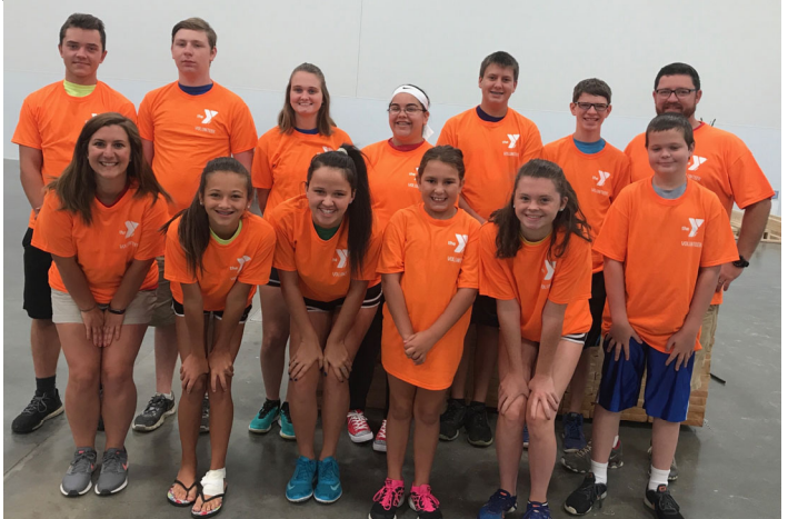
Precious Blood Youth Group members at the Habitat for Humanity Service Project.