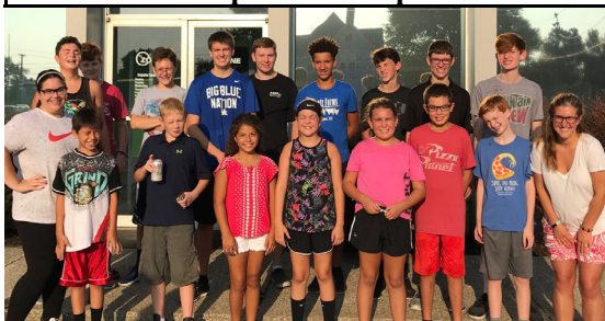
Members of the Youth Group during a night of Laser tag

SUNDAY , September 23—25th Sunday Ordinary Time (First Day of Autumn) Masses: 8:00am, 10:30am Confirmation Formation: 9:00-10:15am Confirmation Commissioning: 10:30am Youth Group: 4:00-6:00pm